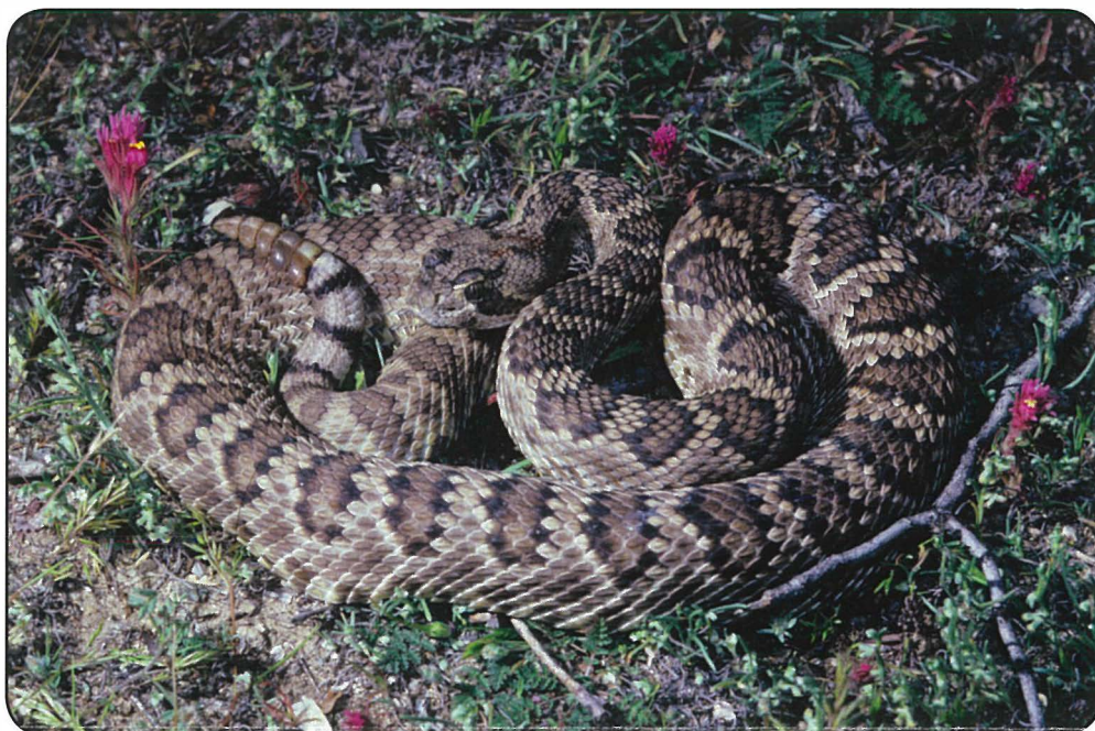
Above, Mojave rattlesnake Below, Sidewinder.

Sauromalus obesus Desert Collared Lizard Crotaphytus insularis Leopard Lizard Gambelia wislizenii Desert Spiny Lizard Sceloporus magister Side-blotched Lizard Uta stansburiana Long-tailed Brush Lizard Urosaurus graciosus Tree Lizard Urosaurus omatus Desert Horned Lizard Phrynosoma platyrhinos Zebra-tailed Lizard Callisaurus draconoides Western Whiptail Cnemidophorus tigris