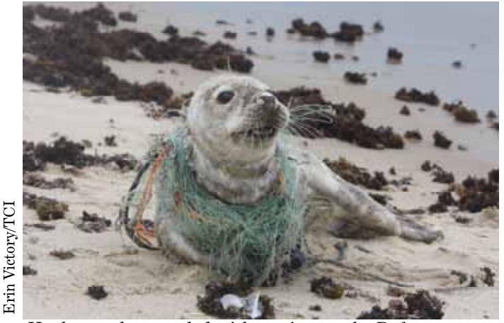
Harbor seal entangled with netting on the Refuge

Nomans Land Island beaches are frequently used by harbor seals and gray seals (state species of special concern) in the fall and winter (USFWS 1992). In recent years, the National Marine Fisheries Service seal monitoring surveys have documented the occasional presence of a female gray seal and pup on the island (Waring et al. 2009). In 1989, a dolphin ( Delphinidae spp. ) vertebra was found on the northeast gravel spit (French 1989), and one dead dolphin ( Delphinidae spp. ) was found on the shore in 1998 (Oliveira 1998a).