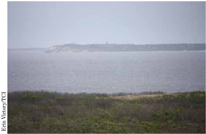
View of Martha's Vineyard from the Refuge

Large mammals, including mastodons, wandered the spruce parkland and grassy savanna, but disappeared quickly at the same time as the glacier receded and humans advanced across the region. Thirty-five to 40 large mammals became extinct 9,000 to 12,000 YBP, while other mammals that were present then, such as white-tailed deer ( Odocoileus virginianus ), are still present today in New England (Pielou 1991, Askins 2002).