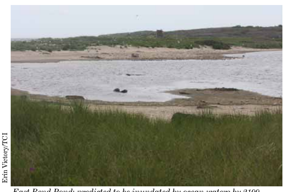
East Bend Pond; predicted to be inundated by ocean waters by 2100