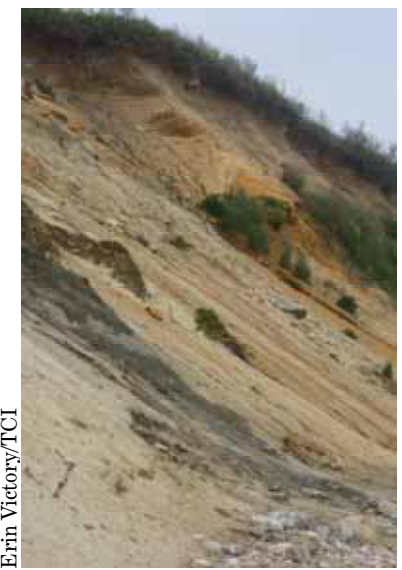
Eroding cliffs reveal geology

Geomorphic regions or "physiographic provinces" are broad-scale subdivisions based on terrain texture, rock type, and geologic structure and history. Our project area lies in the Sea Island Section of the Atlantic Coastal Plain delineated by the U.S. Geological Survey (<a href="http://tapestry.usgs.gov/physiogr/physio.html">http://tapestry.usgs.gov/physiogr/physio.html</a>). Many of these islands off the coast of Massachusetts mark the southern limit of the last glacial maximum (21,000 YBP), and are where terminal moraines of clay-rich, poorly sorted glacial materials were deposited