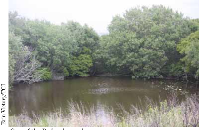
One\ of\ the\ Refuge's\ ponds

Early settlers created artificial ponds on the island, largely on the western portion, by diking the outflow of bogs or digging below the water table and mounding the excavated dirt in a horseshoe shape to retain the water. In total, there are approximately 40 surface acres of spring-fed and runoff-fed waterbodies. In addition, sphagnum-cranberry-type bogs meander over about 200 acres of the island (French 1973c).