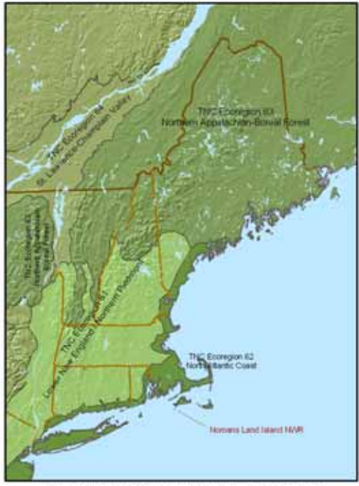
Bird Conservation Regions