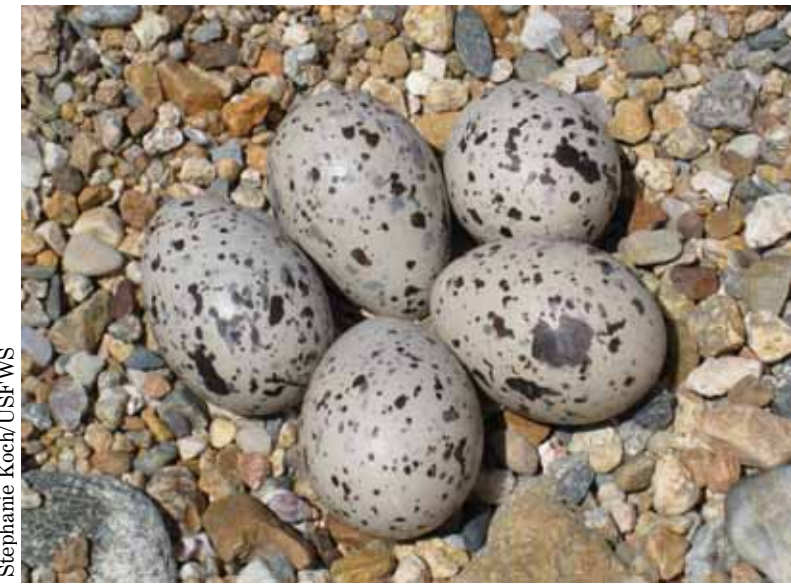
American oystercatcher eggs

the Council on Environmental Quality (CEQ) Regulations for Implementing the Procedural Provisions of NEPA (40 CFR 1500–1508).