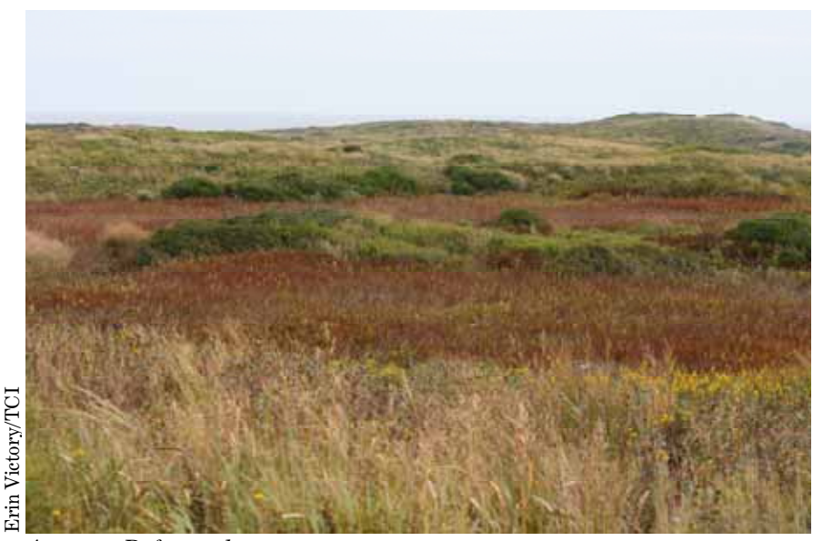
Autumn Refuge colors

Service planning policy requires that we evaluate the potential for wilderness on refuge lands, as appropriate, during the CCP planning process (610 FW 1). Section 610 FW 4 of our Wilderness Stewardship Policy provides guidance on the wilderness review process. Sections 610 FW 1-3 provide management guidance for designated wilderness areas.