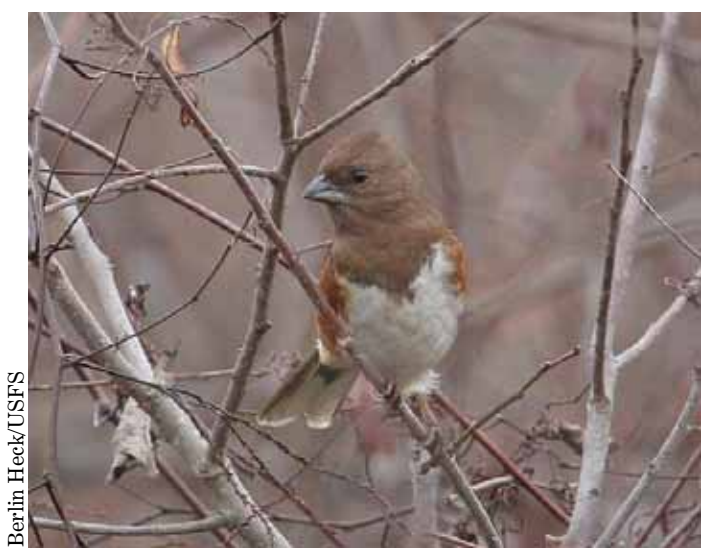
Female eastern towhee

In 1990, PIF began as a voluntary, international coalition of government agencies, conservation organizations, academic institutions, private industries, and citizens dedicated to reversing the population declines of bird species and "keeping common birds common." The foundation of PIF's long-term strategy is a series of scientifically-based bird conservation plans using physiographic areas as planning units.