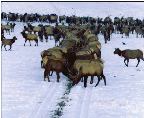
Elk feedline on the refuge.