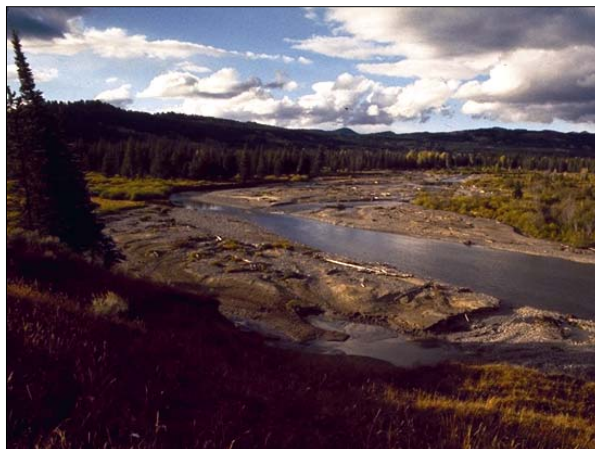
Riparian habitat along Pilgrim Creek in Grand Teton National Park.

Work cooperatively with the state of Wyoming and others to reduce the prevalence of brucellosis in the elk and bison populations in order to protect