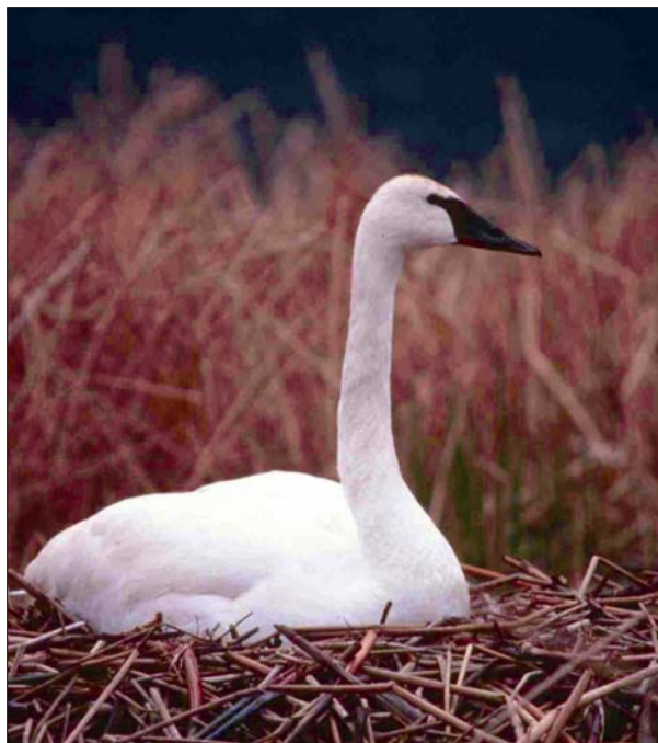
Trumpeter swan nesting on the National Elk Refuge.

woodland habitats and improved habitat conditions.