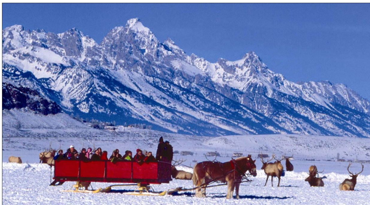
Sleigh ride on the National Elk Refuge, with the Teton Range in Grand Teton National Park as a backdrop.