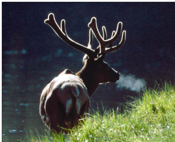
Elk in Grand Teton National Park.

elk annually wintering on the National Elk Refuge and around 2,500 elk summering in the park. Large concentrations of elk in winter would continue to focus on supplemental feedgrounds on the refuge. This alternative would have the highest risk for a non-endemic infectious disease to quickly spread through the elk population, with the potential for a major, adverse impact on survival, population size, and sustainability of the herd. The prevalence of brucellosis in the herd would remain similar to baseline levels and could increase with a larger bison population and more interactions between elk and bison.