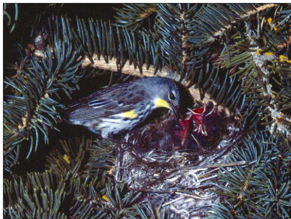
Neotropical migratory birds nest on the refuge and in the park.

winter. Both of these factors were contributing to the increased risk of disease transmission, competition with elk and other wildlife, property damage, erosion, and overgrazing.