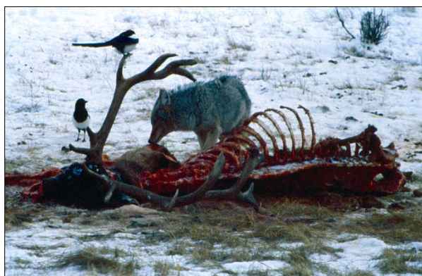
Coyote and magpies scavenging on an elk carcass.

Under Alternative 6 the bison herd would average about 400 animals. Phasing out supplemental winter feeding would cause the bison herd to disperse more widely in search of native forage. The herd would become more responsive to environmental conditions, and winter mortality would fluctuate. Although intensive age-biased harvest in the short term would temporarily alter age and