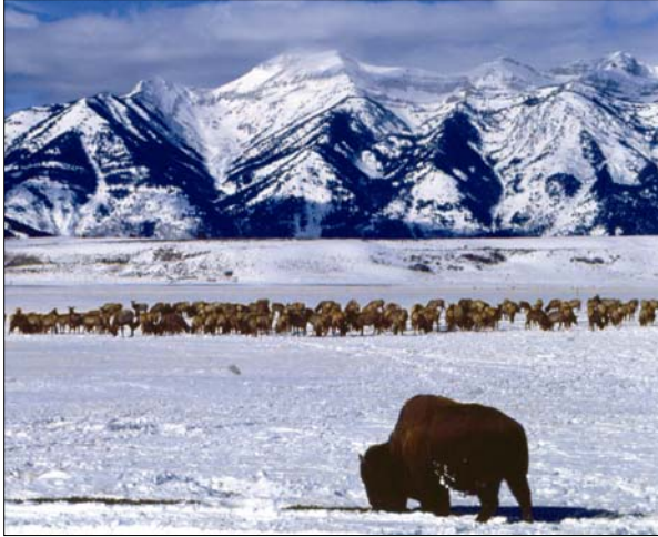
Bison and elk on the National Elk Refuge.

which is in part responsible for preventing the introduction and spread of significant livestock diseases