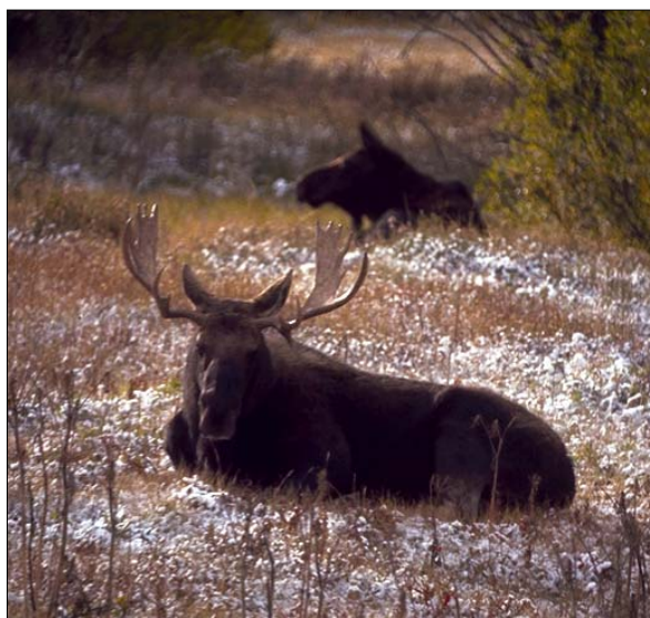
Moose in Grand Teton National Park.

The Jackson elk and bison herds and their habitat would be actively managed on the refuge, with an emphasis on restoring habitat by reducing elk numbers. An estimated 1,000–2,000 elk would winter on the refuge, and 500–1,000 would summer on park lands. Bison numbers would be maintained at current levels (800–1,000) on the refuge and in the park. Supplemental feeding would be reduced over 10 years on the refuge, in coordination with an increased elk harvest program, and eventually feed would only be provided during the severest winters (estimated in roughly 2 of 10 winters and depending on snow conditions). Additionally, the U.S. Fish and Wildlife Service and the National Park Service would support stakeholder efforts to establish elk migration out of Jackson Hole to other wintering areas. Elk hunting on the refuge and, when necessary, the elk herd reduction program in the park would continue, but some hunt areas would be closed after elk objectives were reached. Also, a bison hunt would be initiated on the refuge. The prevalence of brucellosis in the elk and bison herds could decrease over time as a result of fewer concentrated animals, and vaccines with higher efficacies or other techniques would be used when developed. Willow and cottonwood habitat would be sustained for the benefit of other species.