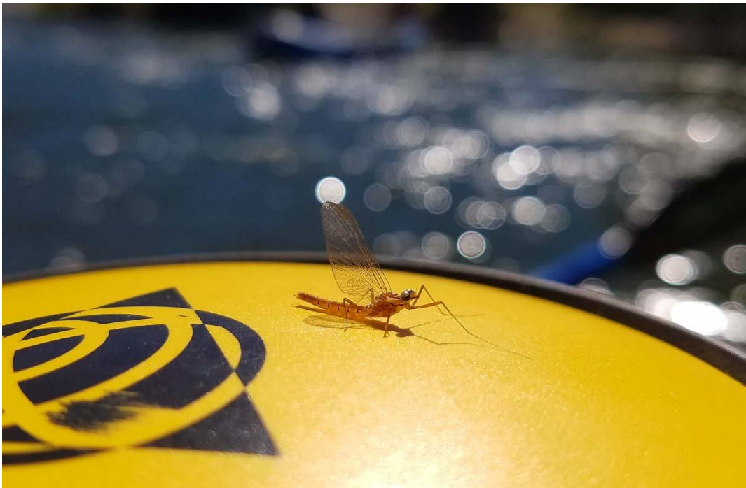
Image of the Week: This little mayfly is catching a ride with a survey crew.

For more information regarding mainstem Trinity River redd surveys, please contact Steve Gough (707-825-5197; steve_gough@fws.gov ) or Derek Rupert (530-623-1805; derek_rupert@fws.gov ).