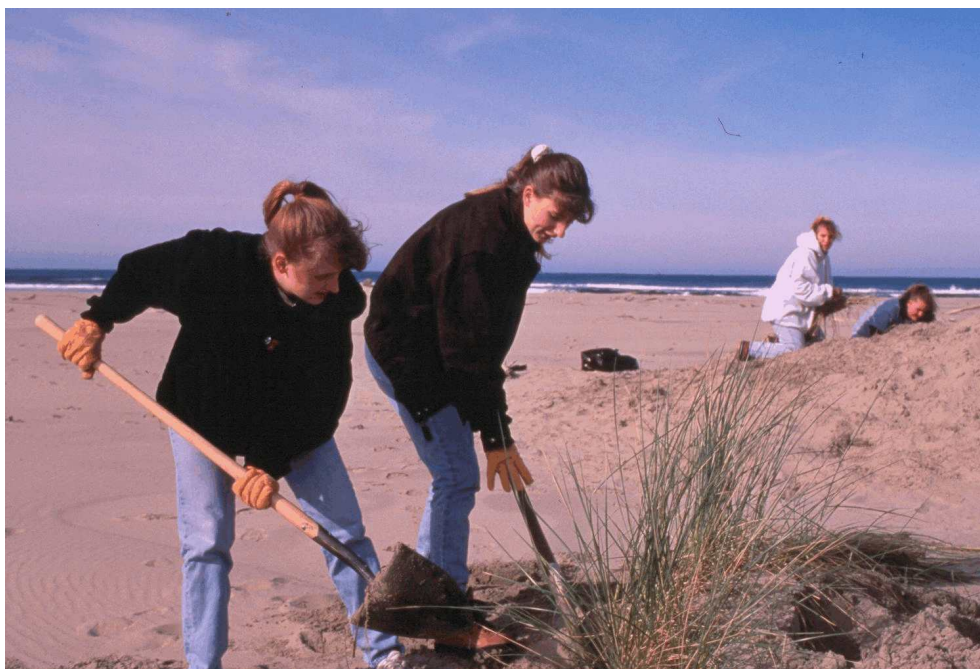
Figure 11. High school students removing European beachgrass.

Recreation Area, Point Reyes National Seashore, and Golden Gate National Recreation Area. Volunteers and docents assist public land managers in many ways (Appendix K), including informing park visitors about threats to the western snowy plover, reducing human and pet disturbances, and assisting with direct habitat enhancement ( e.g. , manual removal of European beachgrass; Figure 11). In 1998, the Western Snowy Plover Guardian Program was developed to assist the conservation and recovery of western snowy plovers in Monterey Bay. This program is mainly a volunteer effort by local citizens who assist in protecting western snowy plovers through monitoring, reporting, and educational activities (D. Dixon in litt. 1998).