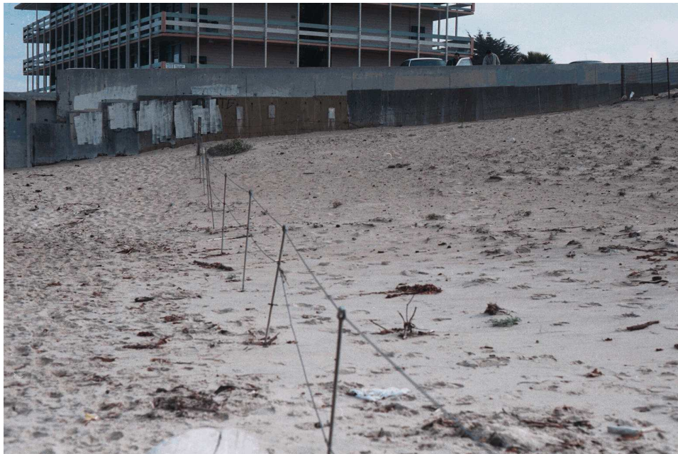
Figure 9. Symbolic fencing on beach at Monterey Bay, California (photo by Ruth Pratt, with permission).

light-weight cord or cable strung between posts to delineate areas where humans (e.g., pedestrians and vehicles) should not enter (Figure 9). It is placed around areas where there are nests or unfledged chicks, and is intended to prevent accidental crushing of eggs, flushing of incubating adults, and, if large enough, to provide an area where chicks can rest and seek shelter when large numbers of people are on the beach. Directional signs (regarding closed areas, nesting sites, etc.) also are used within western snowy plover habitats and near protective fencing to alert the public and other beach users of the sensitivity of western snowy plover nesting and wintering areas. Installation of symbolic fencing at Coal Oil Point Reserve (CA-88) in conjunction with a docent program has allowed management of