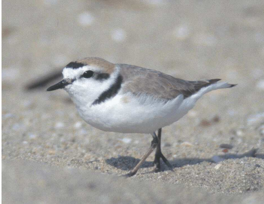
Figure 2. Adult male western snowy plover.

The species was first described in 1758 by Linnaeus (American Ornithologists' Union 1957). Two subspecies of the snowy plover have been recognized in North America (American Ornithologists' Union 1957): the western snowy plover ( Charadrius alexandrinus nivosus ) and the Cuban snowy plover ( C. a. tenuirostris ). The Pacific coast population of the western snowy plover breeds on the Pacific coast from southern Washington to southern Baja California, Mexico. Wintering birds may remain at their breeding sites or move north or south to other wintering sites along the Pacific coast. The interior population of the western snowy plover breeds in interior areas of Oregon, California, Nevada, Utah, New Mexico, Colorado, Kansas, Oklahoma, and north-central Texas, as well as coastal areas of extreme southern Texas, and possibly extreme northeastern Mexico (American Ornithologists' Union 1957). Although previously observed only as a migrant in Arizona, small numbers have bred there in recent years (Monson and Phillips 1981, Davis and Russell 1984). Interior population birds breeding east of the Rockies generally winter along the Gulf coast, while most interior population birds breeding west of the Rockies winter in coastal California and Baja