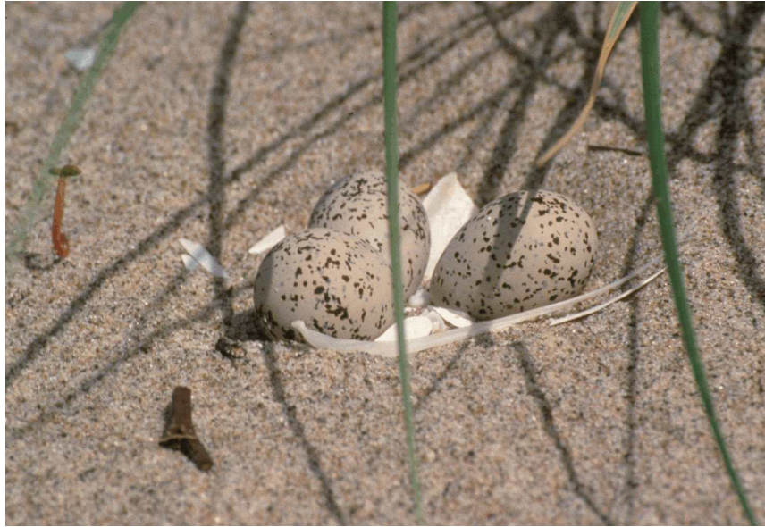
Figure 4. Western snowy plover clutch.

incubation of completed clutches. More typical, however, is for the incubating adult to run away from the eggs without being seen. Incomplete clutches are those in which all eggs have not been laid. Partly-incubated clutches are those clutches having some degree (in days) of incubation.