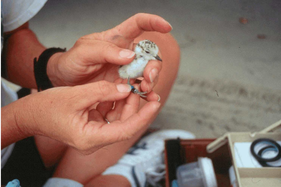
Figure 10. Banding a western snowy plover chick

Intensive management at the Moss Landing Wildlife Area has made a major contribution to western snowy plover breeding success in the Monterey Bay area. Management by Point Reyes Bird Observatory staff, in coordination with the California Department of Fish and Game, has been ongoing since 1995. Management activities include draw-down of water levels in part of the salt ponds at the beginning of the nesting season to provide dry sites for nests, and flooding of remnant wet areas twice per month through the nesting season to maintain foraging habitat for adults and their young. Predator control is conducted by the U.S. Department of Agriculture, Wildlife Services Branch.