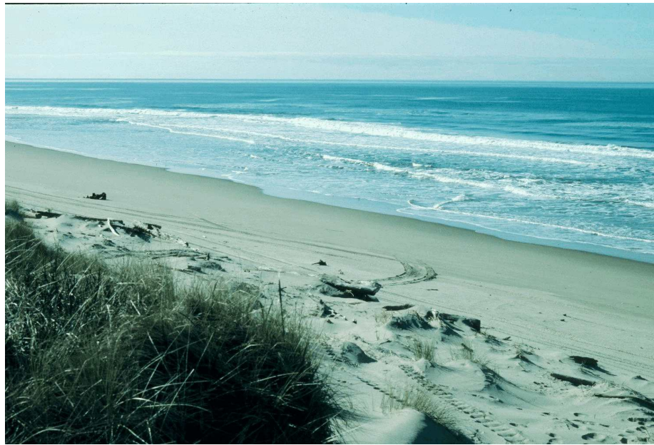
Figure 3. Coastal beach in Oregon Dunes National Recreational Area

unconsolidated soils, high winds, storms, wave action, and colonization by plants. Less common nesting habitats include bluff-backed beaches, dredged material disposal sites, salt pond levees, dry salt ponds, and river bars (Wilson 1980, Page and Stenzel 1981, Powell et al. 1996, Tuttle et al. 1997).