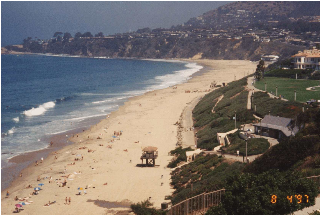
Figure 6. Recreationists at Salt Creek Beach, California (photo by Ruth Pratt, with permission).