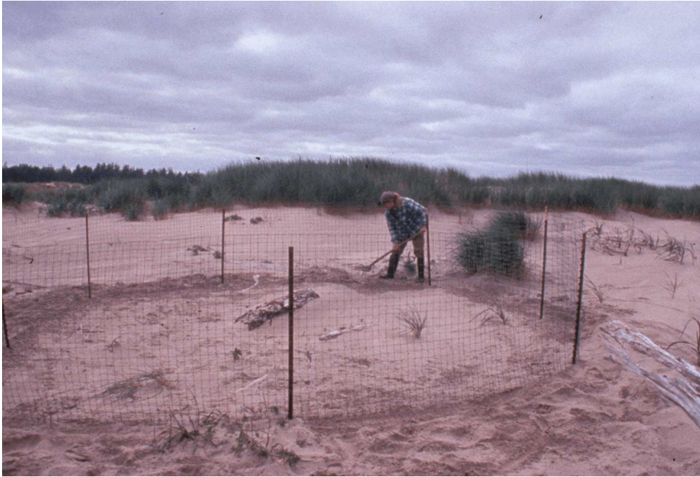
Figure 8. Erecting western snowy plover enclosure.

Although exclosures are contributing to improved productivity and population increases in some portions of the western snowy plover's Pacific coast range, problems have been noted in some localities. Potential risks associated with exclosures include vandalism, disturbance of the birds by curiosity seekers, and use of exclosures as predator perches. Over time, exclosures may provide a visual cue to predators, making it easier for them to target adults, chicks, and eggs, and requiring predator management. On several occasions depredations of adult western snowy plovers have been documented in or near exclosures, and efforts have been made to establish exclosures later in the season after the peak migration of raptors (Brennan and Fernandez 2004, Lauten et al. 2006). Also, predator exclosures may be impractical where western snowy plovers nest within California least tern colonies or other instances where such exclosures may conflict with the needs of other threatened or endangered species.