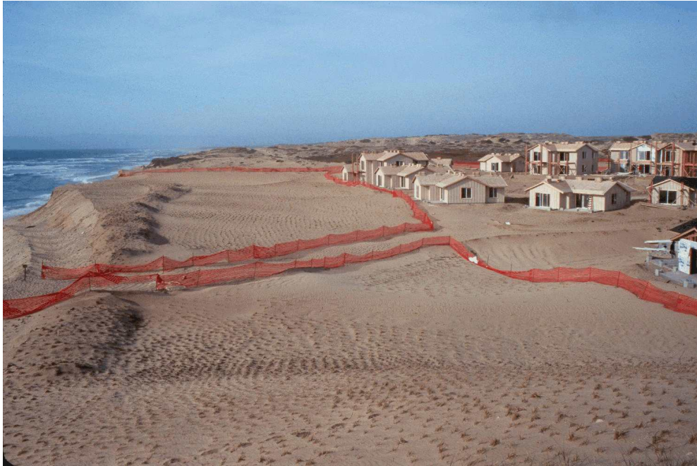
Figure 5. New housing development next to beach at Monterey Bay, California (photo by Peter Baye, with permission).

incubating western snowy plovers, destroy their nests or chicks, and result in the loss of invertebrates and natural wave-cast kelp and other debris that western snowy plovers use for foraging. Mining of surface sand from the 1930s through the 1970s at Spanish Bay in Monterey County degraded a network of dunes by lowering the surface elevations, removing sand to granite bedrock in many locations, and creating impervious surfaces that supported little to no native vegetation (Guinon 1988).