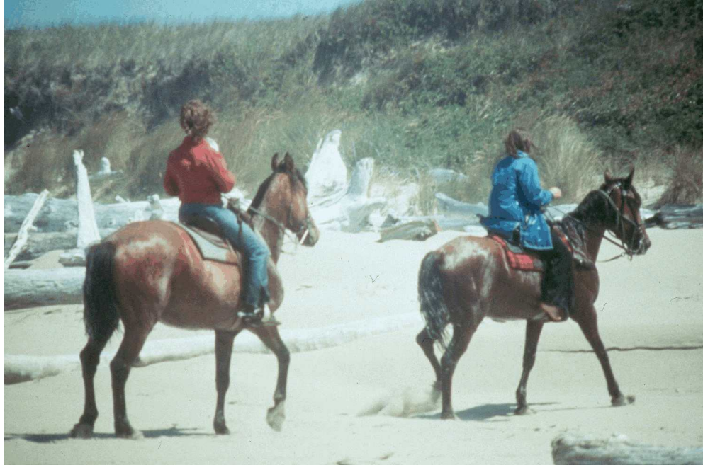
Figure 7. Equestrians on beach.