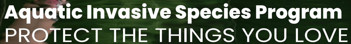
Photo: Gliding through summer vibes and mirrored reflections on the lake.

When aquatic invaders threaten our waters, we don't hesitate—we act