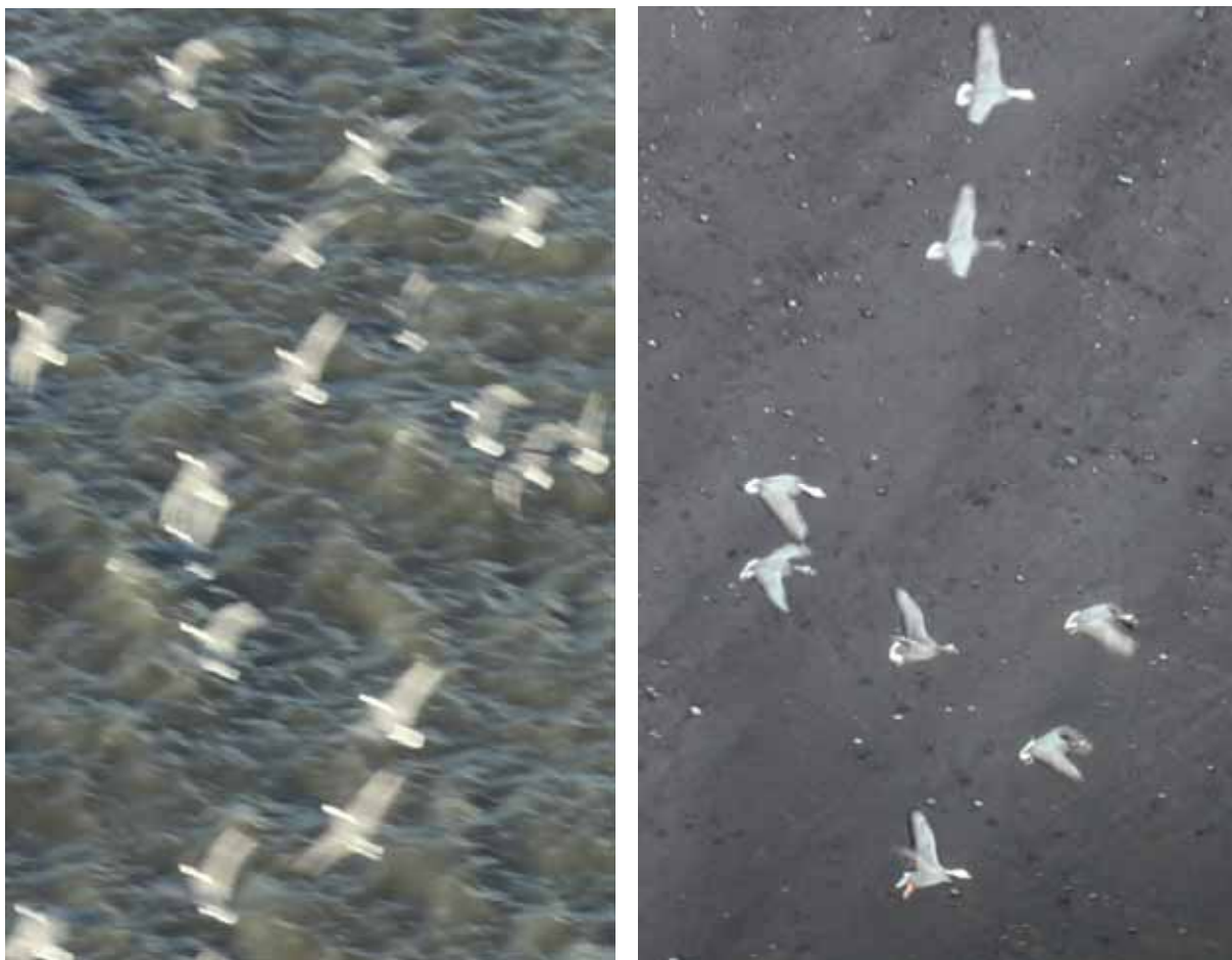
Figure 3. Enlarged portions of photographs showing two problems encountered during the 2013 photographic sampling of Emperor goose flocks to determine October age ratio. The left picture has 13 adults and 4 juveniles, adequately age-classified even though blurred. The right photo has 3 adults and 5 young, identifiable even with partially molted head plumage.

The average count-weighted proportion of juvenile Emperor geese across all 29 years was 0.192 (SD = 0.0582). The average within-year estimate of sampling error of 0.0108 was considerably smaller, only 19% of the estimated between year variation. Given this consistently low sampling error in the annual estimates of proportion juveniles, we considered the differences among years in the age ratio an accurate indication of actual change in the year-specific production of young. The count-weighted proportions of juveniles have ranged from a minimum of 0.094 in 2003 to a maximum of 0.352 in 2006. The age ratio calculated by the two weighting methods showed less than a 0.010 difference in 17 of 29 years. The largest differences between methods were 0.026 in 2007 and -0.021 in 2010. The average difference between weighting methods was -0.0013 (SD = 0.0109).