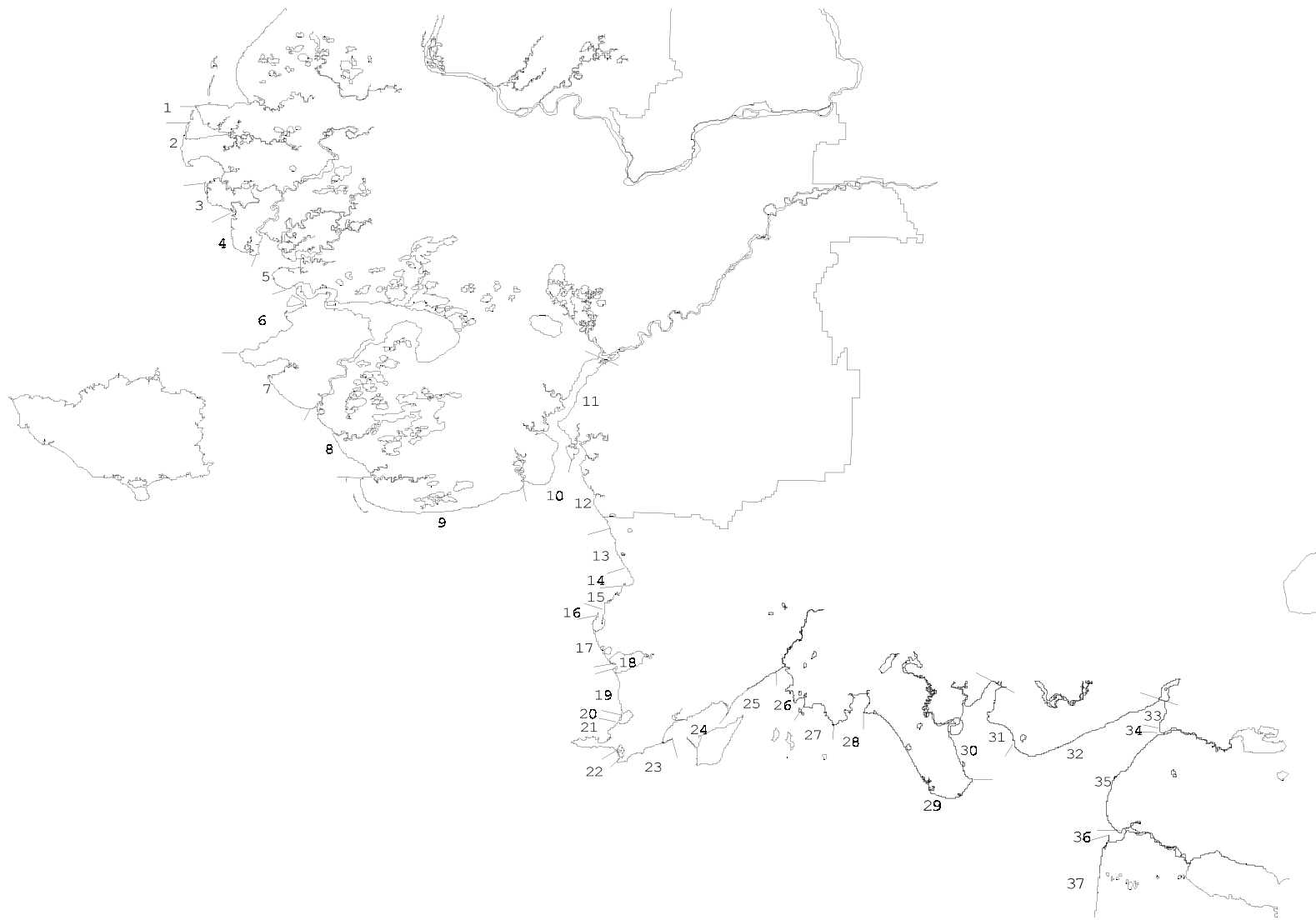
Figure 1. Map of emperor goose aerial survey segments 1-36 in southwest Alaska, 1992-2005.