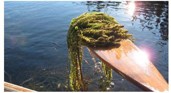
Canadian waterweed infestation in Chena Slough, Alaska

BACKGROUND: Aquatic plants grow in a variety of habitats including lakes, ponds, streams, rivers, bogs and wetlands. Some aquatic plants grow out of the water along the shoreline; others have leaves that float on the surface, while many live completely underwater. Native aquatic plants provide food and shelter for fish, birds, moose and other wildlife. They also help stabilize habitat along lake and river banks. However, invasive aquatic plants can become a serious nuisance to natural systems and also a danger to safe floatplane operation.