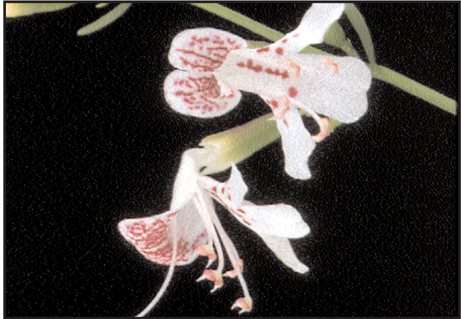
Scrub mint flower.

Scrub mint needs insects for pollination. Its flowers have spurred anthers, which require triggering by insects to release and disperse pollen (FWS 1987). Though visited by a variety of insects (Huck et al. 1989), the scrub mint is pollinated mainly by bee-flies (Menges 1992). Its flowering occurs from August through winter, and fruit production occurs from September through winter (Wunderlin 1984).