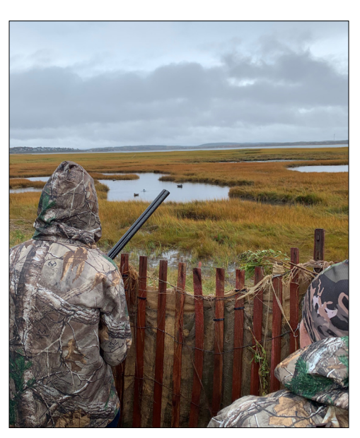
Waterfowl hunters wait in a blind.

Hunters are required to obtain valid state licenses, permits, and stamps before engaging in any hunting activity. A refuge permit is not required, and there are no refuge reporting requirements. Hunters recovering banded birds are encouraged to report them to www.reportband.gov. All state and federal regulations apply to hunting at the refuge.