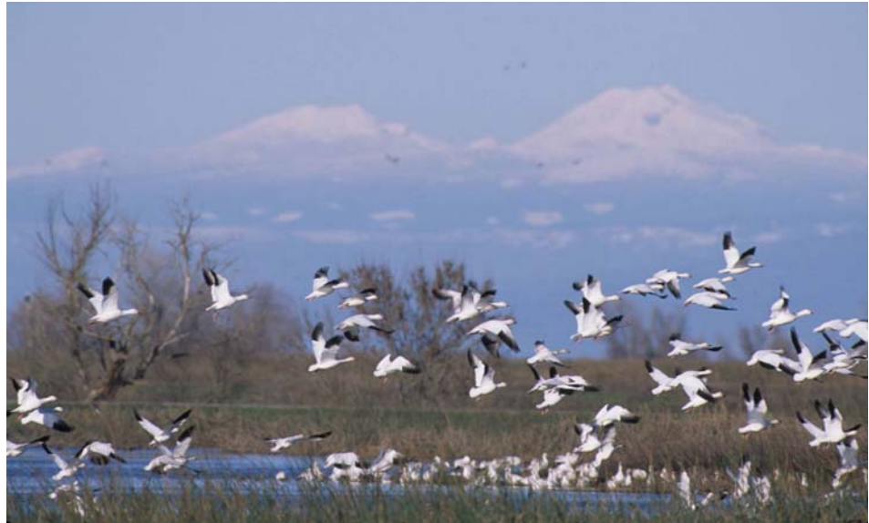
Snow geese at Sacramento NWR

Copies of the Draft CCP/EA can also be viewed during normal business hours at libraries in Butte, Glenn, Colusa, and Sutter counties as well as Westside Outdoorsman in Willows and Kittles Outdoor & Sport Co. in Colusa.