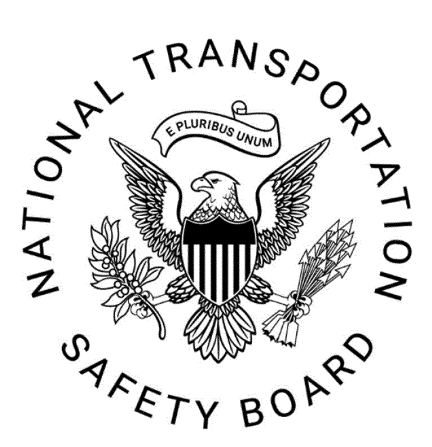
Figure 1 to § 803.1