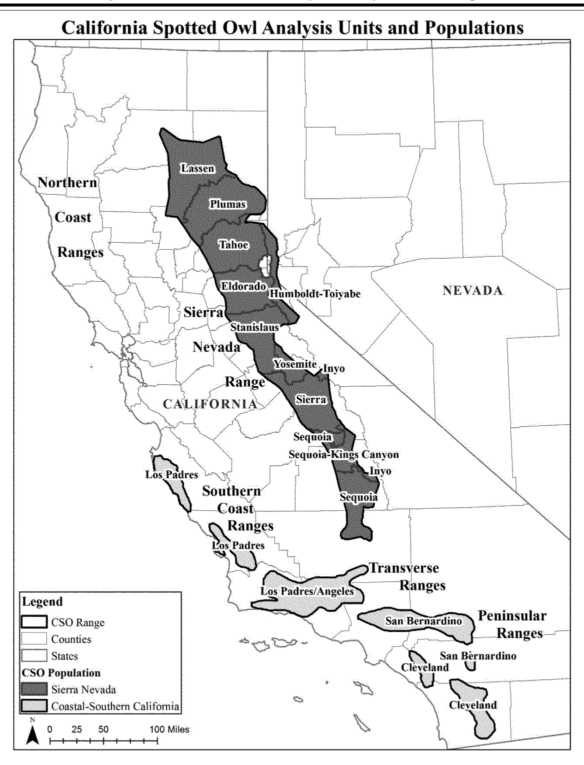
Figure 1—Populations and Analysis Units of the California Spotted Owl (CSO)