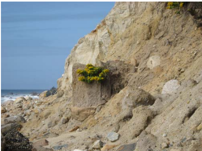
Goldenrod growing from cliff on Nomans