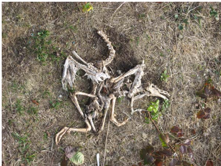
Bird skeleton on Nomans Land Island

These draft Goals and Objectives are provided for your information. There is no formal comment period at this point in the planning process. We do, however, welcome your thoughts at any time. Contact information is provided elsewhere in this Planning Update