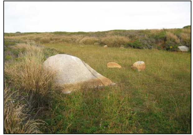
Wet field on Nomans Land Island

Preserve archaeological resources on Nomans Land Island from destruction by coastal erosion or artifact looting.