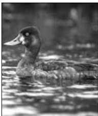
Lesser Scaup

Hawks and owls are common sights during spring, summer and fall. Red-tailed hawks, harriers and kestrels are the most abundant. Great-horned owls are present throughout the year, and can be seen or heard most often at dawn or dusk.