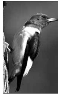
Red-headed Woodpecker; Richard Armstrong

Activities not expressly permitted are prohibited. If you have any questions, please check with refuge staff at the refuge office.