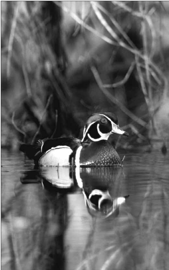
Wood Duck