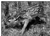
Fawn

White-tailed deer can be seen in fields, on the roadsides, and in refuge savannas year-round.