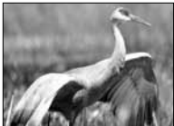
Sandhill Crane

Swans can be seen on the refuge during spring, summer and fall. There are two species that spend time on the refuge; the trumpeter and tundra. The most abundant are the tundra swans, which don't nest here, but can be seen during the migration. Trumpeters were non-existent in Wisconsin in the early 1900s. In 1994, 25 cygnets were reared on the refuge in hopes of establishing a breeding population. Eggs were removed from nests in Alaska and transported to the Milwaukee Zoo where they were hatched in incubators. This species now nests on the refuge.