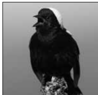
Bobolink, Richard Armstrong

Songbirds can be found throughout the refuge. Ground nesting birds such as bobolink and field sparrow, and shrub nesters, like the gray catbird and brown thrasher, are common during mid-June. Canopy nesting species such as the northern oriole, scarlet tanager, and wood peewee can also be seen.