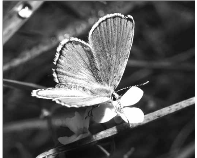
Karner Blue Butterfly

Karner blue butterflies can be seen on Lupine Loop and Boghaunter Trails, which have an abundance of wild lupine. Each year, two generations of this butterfly hatch, and adult butterflies emerge in late May/early June and in late July/early August. Wild lupine is critical to the butterfly because the Karner larvae feed exclusively on lupine and the adults rely on a lupine and a variety of other wildflowers for their food, feeding on the nectar. The Karner blue butterfly is an endangered species. Killing or molesting the butterfly or destroying its habitat is a federal offense; fines of up to $10,000 and/or 1 year in jail can be levied.