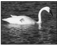
Trumpeter Swan