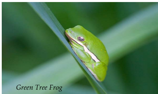
Green Tree Frog