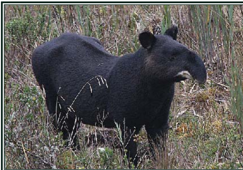
The endangered Andean tapir ( Tapirus pinchaque ).