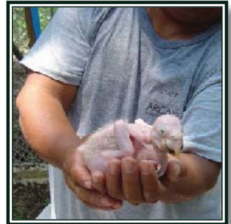
A scarlet macaw chick ( Ara macao ) will be released into the protected forests of the Mayan Biosphere Reserve.