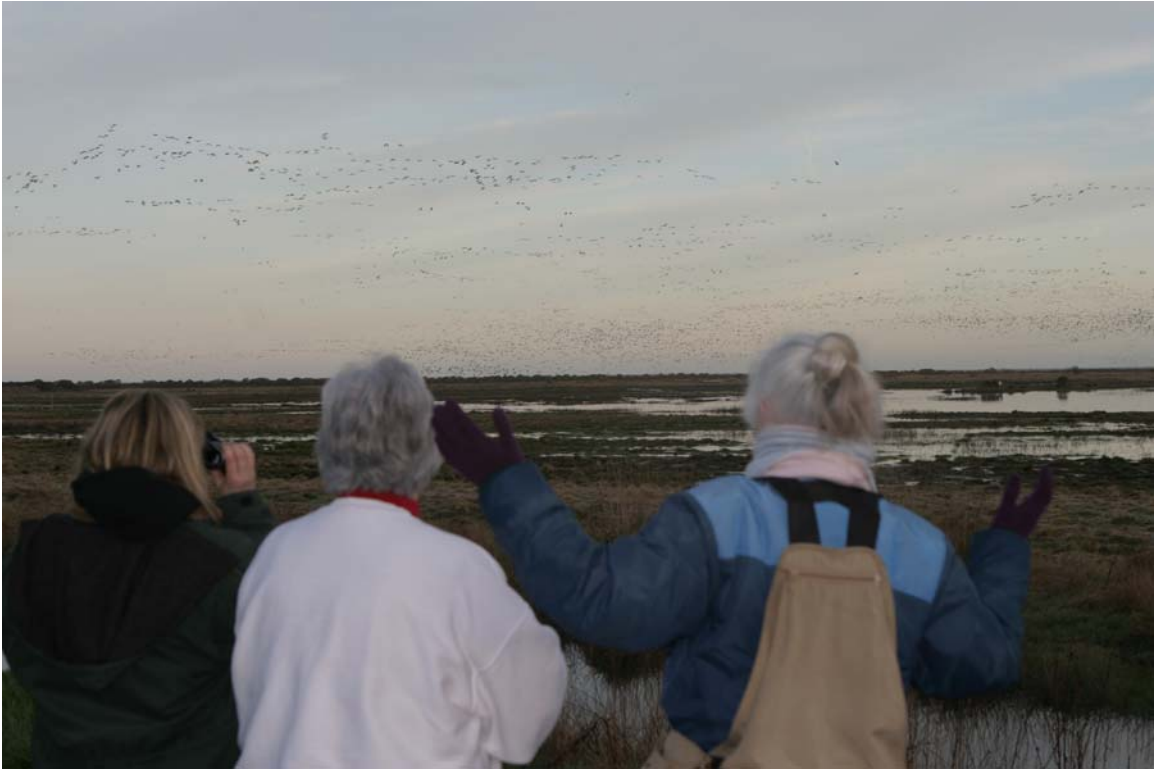
Image from the 2008 Fly-Off and Family Fun Day