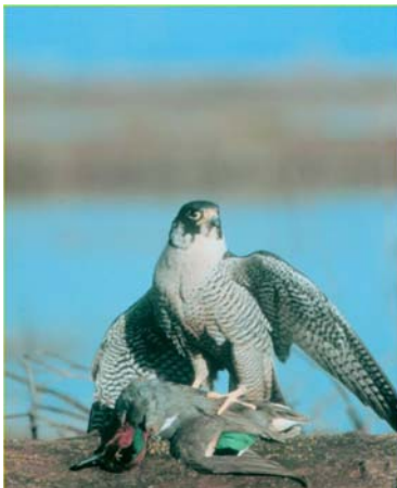
Classic Peregrine Falcon photo by Gary Kramer.