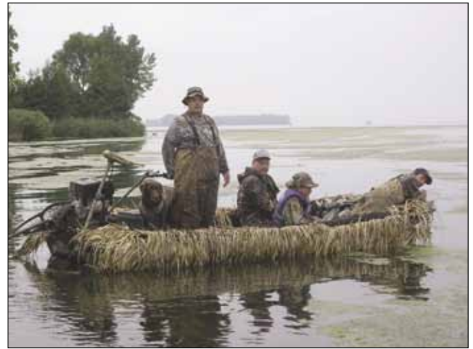
Youth Duck Hunt , Gibraltar Duck Hunters Association