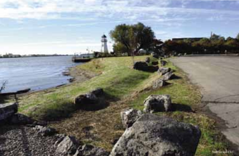
Before-and-after photos showing soft engineering techniques at DTE's River Rouge Power Plant, Nativescape