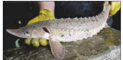
Young Lake Sturgeon

More than 10 million walleye migrate through the Detroit River each year. Lake sturgeon, threatened with extinction in 19 of the 20 states in their range, once spawned in swift currents on the rocky river bottom near Grassy Island. Recent research shows that the fish are reproducing in the lower Detroit River once again. Lake whitefish are also spawning there for the first time in 90 years.