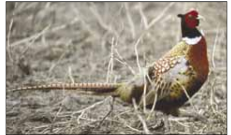
Photos from top: Bald Eagles , Trumpeter Swan , Ring-necked Pheasant

Red-winged blackbirds, tundra and trumpeter swans, American woodcock, common loons, belted kingfishers, and many species of songbirds call this area home during the spring and summer months. Ring-necked pheasants and bob-white quail are year-round residents.