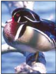
Wood Duck

More than three million waterfowl migrate through the Great Lakes area annually. American black ducks gather in the marshes of western Lake Erie before completing their fall journey south. Migrating canvasbacks rest and feed on beds of wild celery in the lower Detroit River. Wood ducks, mallards, and blue-winged teal nest in the area.