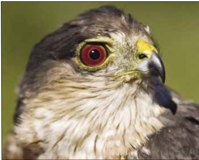
Sharp-shinned Hawk