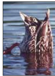
Dabbling for Food

Staff and partners use soft engineering techniques to restore portions of the lower Detroit River and Lake Erie shorelines. By replacing concrete with natural materials, they stabilize the banks while improving wildlife habitat.