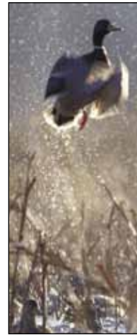
Rising Mallard

Waterfowl hunting has been popular in the area for centuries. Many hunters use layout boats and large rafts of decoys to attract diving ducks on the open waters of the Detroit River and western Lake Erie. State law allows duck and goose hunting along the Detroit River and Lake Erie, as long as the hunter is standing in the water, shooting his or her gun away from the shoreline, and at least 450 feet from an occupied building. Pointe Mouillee State Game Area, owned and managed by the Michigan Department of Natural Resources and not part of the refuge, is open to hunting and has a boat launch.