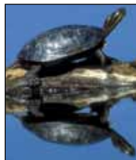
Painted Turtle

The Detroit River and western Lake Erie have been noted for their variety of plants and animals in the North American Waterfowl Management Plan, the United Nations Convention on Biological Diversity, and the Biodiversity Investment Area Program of Environment Canada and the U.S. Environmental Protection Agency.