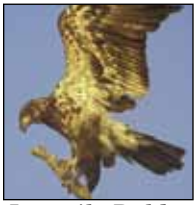
Juvenile Bald Eagle , LeBlanc

Almost three miles of trails at Lake Erie MetroPark take hikers along the Detroit River and Lake Erie shorelines and through coastal marshes, and dense hawthorn thickets. The annual Hawkfest celebrates the migration of birds of prey in September.