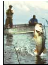
Fishing

Waterfowl hunting has been popular in the area for centuries. Many hunters use layout boats and large rafts of decoys to attract diving ducks on the open waters of the Detroit River and western Lake Erie. State law allows duck and goose hunting along the Detroit River and Lake Erie, as long as the hunter is standing in the water, shooting his or her gun away from the shoreline, and at least 450 feet from an occupied building. Pointe Mouillee State Game Area, owned and managed by the Michigan Department of Natural Resources and not part of the refuge, is open to hunting and has a boat launch.