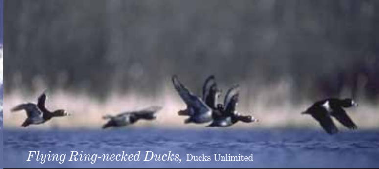
Flying Ring-necked Ducks, Ducks Unlimited

Eagle Island Marsh, Automotive Components Holdings