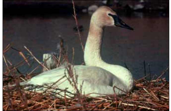
Trumpeter Swan

The 410-acre Humbug Marsh Unit, the last mile of natural Detroit River shoreline on the U.S. mainland, has trails and an observation deck that offer excellent bird watching and hiking. Next to Humbug Marsh is the 44-acre Refuge Gateway, where the refuge headquarters and visitor center are being created in partnership with Wayne County, Huron Clinton Metropolitan Authority, the International Wildlife Refuge Alliance, Friends of the Detroit River, Detroit Audubon, Wayne County Community College, Michigan Sea Grant and others. The visitor center will provide educational and interpretive displays and programs, and will allow visitors to explore Humbug Marsh.