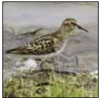
Least Sandpiper , LeBlanc

A wide variety of wading birds and shorebirds lives here during the summer months. Great blue herons and common egrets hunt in the shallows. Dunlins, spotted sandpipers, yellowlegs, and dowitchers probe the sands for tasty morsels. The Lake Erie shoreline has been named a Site of Regional Shorebird Importance in the Western Hemispheric Shorebird Reserve Network.